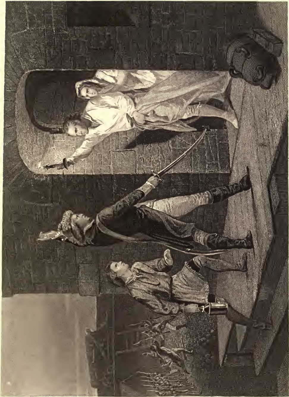
CAPTIVE OF NORDI TICHONKOFF.

From the "North American Review," Vol. 1, No. 1, 1854.